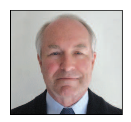
FROM THE CHAIRMAN OF THE BOARD

■ The Discovery Eye Foundation's goal is to help as many people, in as many places, as we possibly can. Through our educational programs, we do this in more ways than I'd ever thought possible.